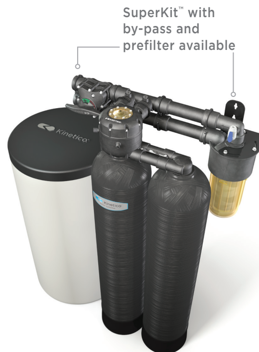
Model Shown: 2060s

Platinum 10 Year Limited Warranty: Enjoy years of dependability and peace of mind with one of the most comprehensive warranties in the industry.